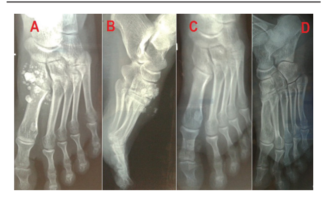
(a, b) Preoperative radiograph (anteroposterior and lateral) showing multiple radio-opaque loose bodies scattered around the first tarsometatarsal joint, mainly on the dorsomedial aspect, and (c, d) postoperative radiographs showing removal of all loose bodies.