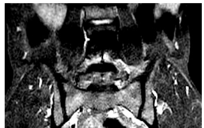
MRI sacroiliac joint (coronal short tau inversion recovery sequence) in a 25-year-old axial spondyloarthropathy man showing bone marrow edema (arrows) bilaterally.