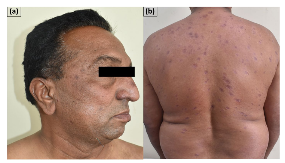
Fig. 3 a, b Complete resolution of cutaneous lesions with post-inflammatory hyperpigmentation after 4 weeks of prednisolone and methotrexate therapy