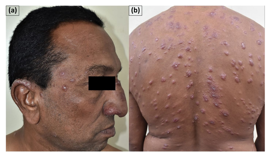
Fig. 1 a Multiple erythematous papules and plaques involving temporal region, earlobes, root of nose and alae nasi. b Shiny erythematous papules and plaques with central umbilication over few lesions on the trunk.