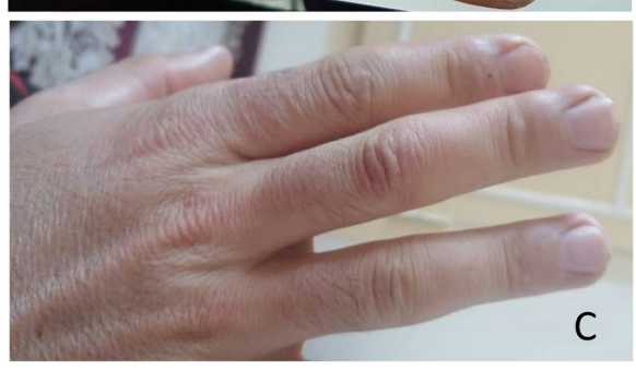
Fig. 1 A Unilateral solitary erythema elevatum diutinum. Well-defined red brown plaque with some nodularity just on the extensor surface of proximal interphalangeal joint of the third finger of right hand is seen. B Significant reduction of the size of the lesion during treatment. C Near-complete resolution of the lesion after 2 weeks of treatment with dapsone 100 mg BID without any recurrence after 2 years of follow-up. All images were obtained using SAMSUNG S7 Edge's cellphone camera

diagnosed polymyalgia rheumatica in his mother. Because of the failure of local and systemic treatments including corticosteroids, a biopsy had been taken 3 years ago which revealed pseudoepitheliomatous hyperplasia with mixed inflammation and no clear evidence of any specific diagnosis. He was reluctant to undergo another procedure. Inflammatory markers including erythrocyte